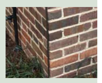
Above (3): Lightning protection elements such as strike termination devices, conductors and grounding are barely visible to the untrained eye.